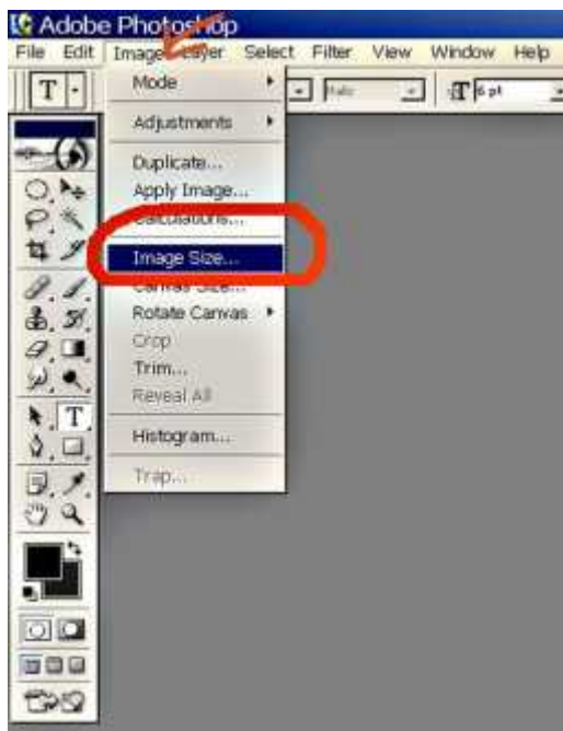
- Image Size

Pictures should be a maximum of 640 pixels on one side. The maximum height or width can be 640 pixels, ie: 640w x 480h or 480w x 640h is okay. Files should be saved as a JPEG with medium-high quality (6-7). Pictures may be re-sized at the discretion of the web master to fit the available space. When saving and sending your photo's, if you could make sure that they approx. 100 kb in file size. (Resizing below in Photoshop).